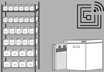
Kanban systems for fasteners and fixing

Maximum productivity in C-Parts management: It's time to get started!