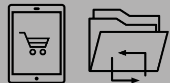
E-Business solutions to streamline your processes